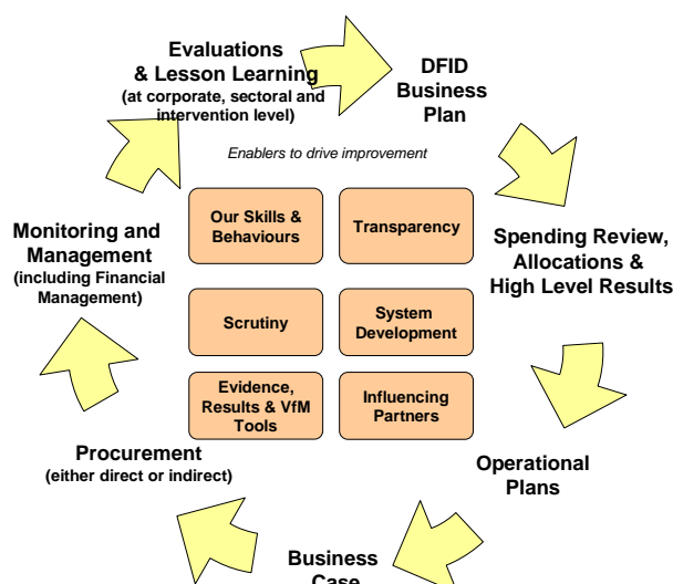
Figure 2: DFID Results & VfM Framework

The Investment Committee doesn't feature in the diagram but plays a key role in overseeing the whole VfM cycle and setting priorities for its improvement.